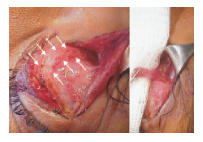
FIG. 2. Intraoperative photograph of anomalous muscle inserting along the nasal portion of the superior tarsal border.

Congenital retraction of the upper or lower eyelid is a poorly defined entity about which little is known.<sup>7</sup> The disorder has only been reported as unilateral. The diagnosis is made when eyelid retraction is present from birth in the absence of trauma, thyroid disease, proptosis, or abnormalities of cranial nerves III or VII. Inferior rectus restriction with an overacting superior rectus–levator